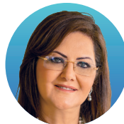
H.E. Prof Hala El Said Minister of Planning and Economic Development, Egypt