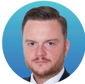
Mr Marko Primorac Minister of Finance, Croatia