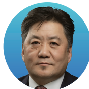
Mr Lkhagvasuren Byadran Governor, Central Bank of Mongolia