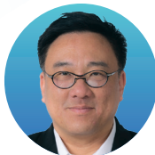
Mr Julapun Amornvivat Deputy Minister of Finance, Thailand