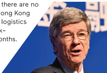
Prof Jeffrey D. Sachs President, UN Sustainable Development Solution Network

The current path towards geo-economic fragmentation has passed its tipping point. It is very hard to reverse and would require a global agreement to figure out how to get out of this.