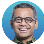
Mr Suhasil Nazara Vice Minister of Finance, Indonesia