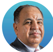
H.E. Dr Mohamed Maait Minister of Finance, Egypt