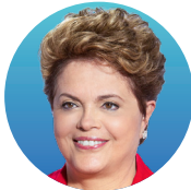
Mrs Dilma Rousseff President, New Development Bank