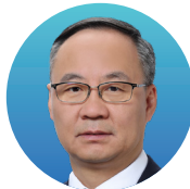
Mr Li Yunze Minister, National Financial Regulatory Administration