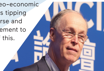
Prof Douglas W. Diamond Nobel Laureate Economic Sciences in 2022

The current path towards geo-economic fragmentation has passed its tipping point. It is very hard to reverse and would require a global agreement to figure out how to get out of this.