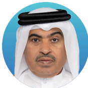
H.E. Ali bin Ahmad Al Kuwari Minister of Finance, Qatar